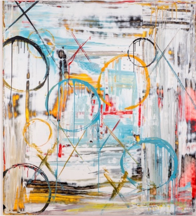
XOXO „kisses and hugs in different emotions“