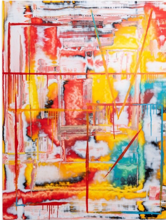
Full of Love (3/3)