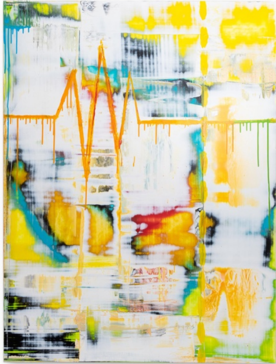
Full of Life (3/3)